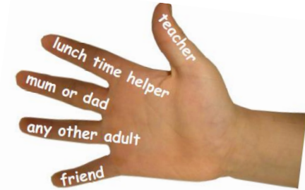
A HELPING HAND